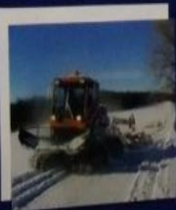
All WI trails are groomed by volunteer club members