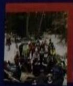
The Future Leaders of the AWSC

WISCONSIN 2013 JUNE 6, 7, & 8 - GREEN BAY 45TH INTERNATIONAL SNOWMOBILE CONGRESS www.ISC2013.org